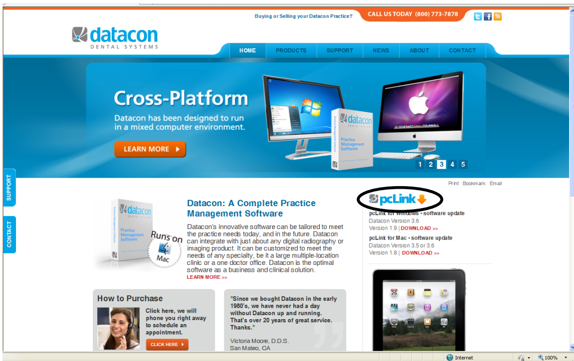
Figure 1: pcLink Downloads